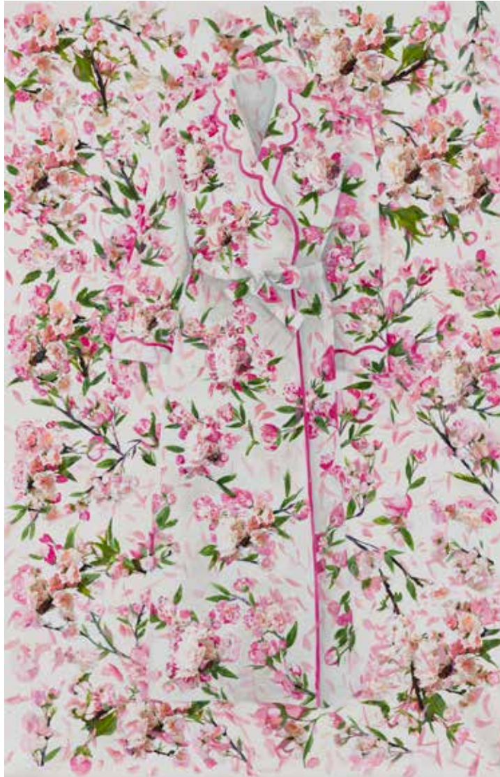
Flamingo Pink Robe , Rachel Lee Hovnanian, 2023

Her paintings show how individuals have become disconnected from the world and each other, trapped in a cycle of consumption, synthetic substitutions, and desire surrounded symbolically by luxurious hedges and plantings. The impenetrable protective hedges are a barrier between a synthetic paradise and the outside world. The stark pool and pool house areas surrounded by hedges, serve as a symbol of restraint and captivity. The hedges also symbolize how power shapes our social interactions, creating a sense of separation and distance between those with access to the pool or garden and those without access.