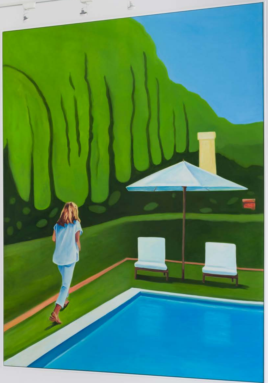
Where the Hedges Meet the Sky