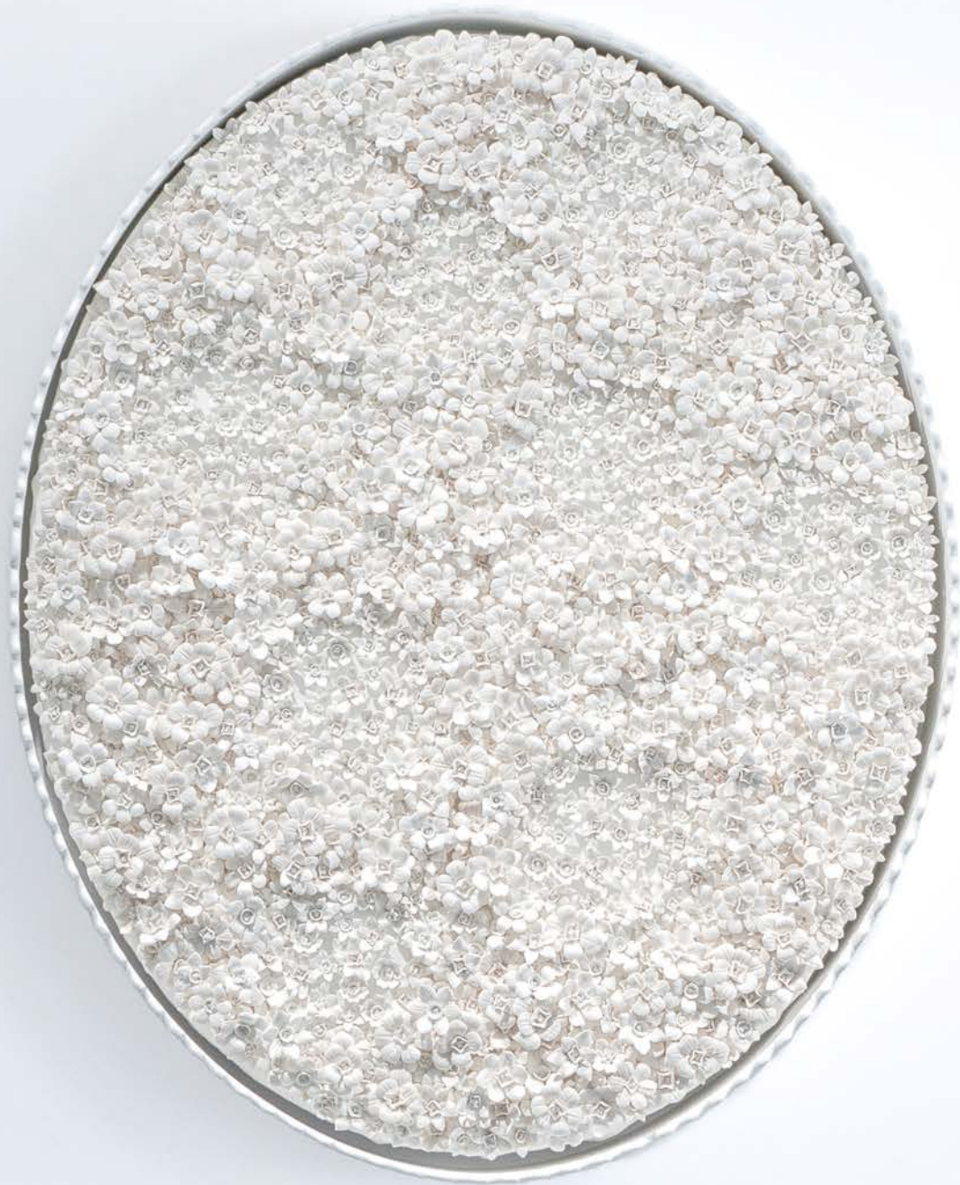
White Narcissus Panel (Jupiter)

Porcelain, waxed cotton, linen, in artist's frame