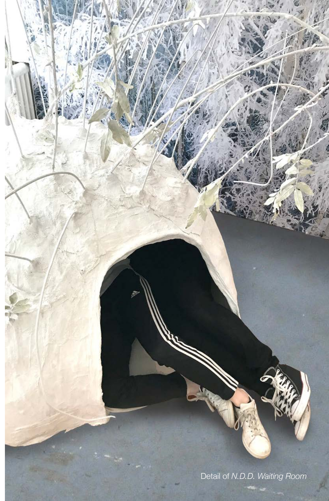
Detail of N.D.D. Waiting Room