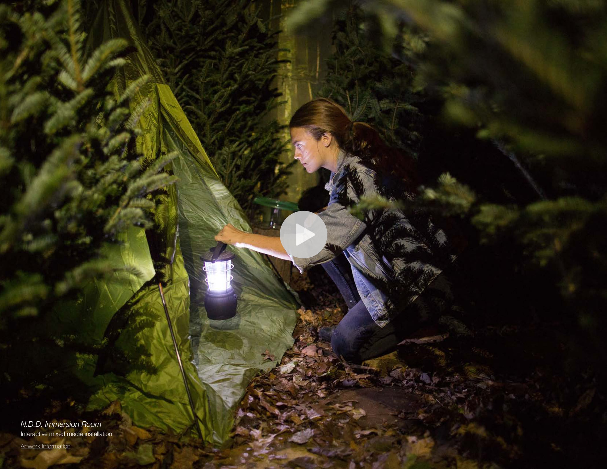
N.D.D. Immersion Room Interactive mixed media installation