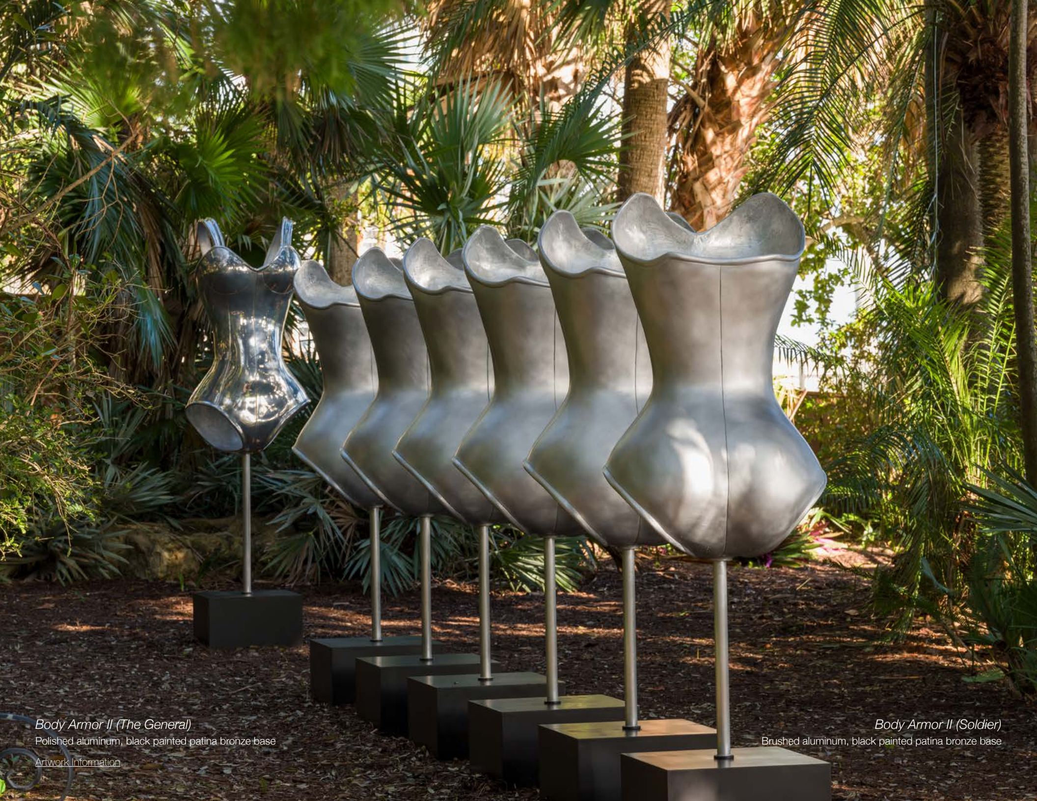
Body Armor II (The General)

Polished aluminum, black painted patina bronze base