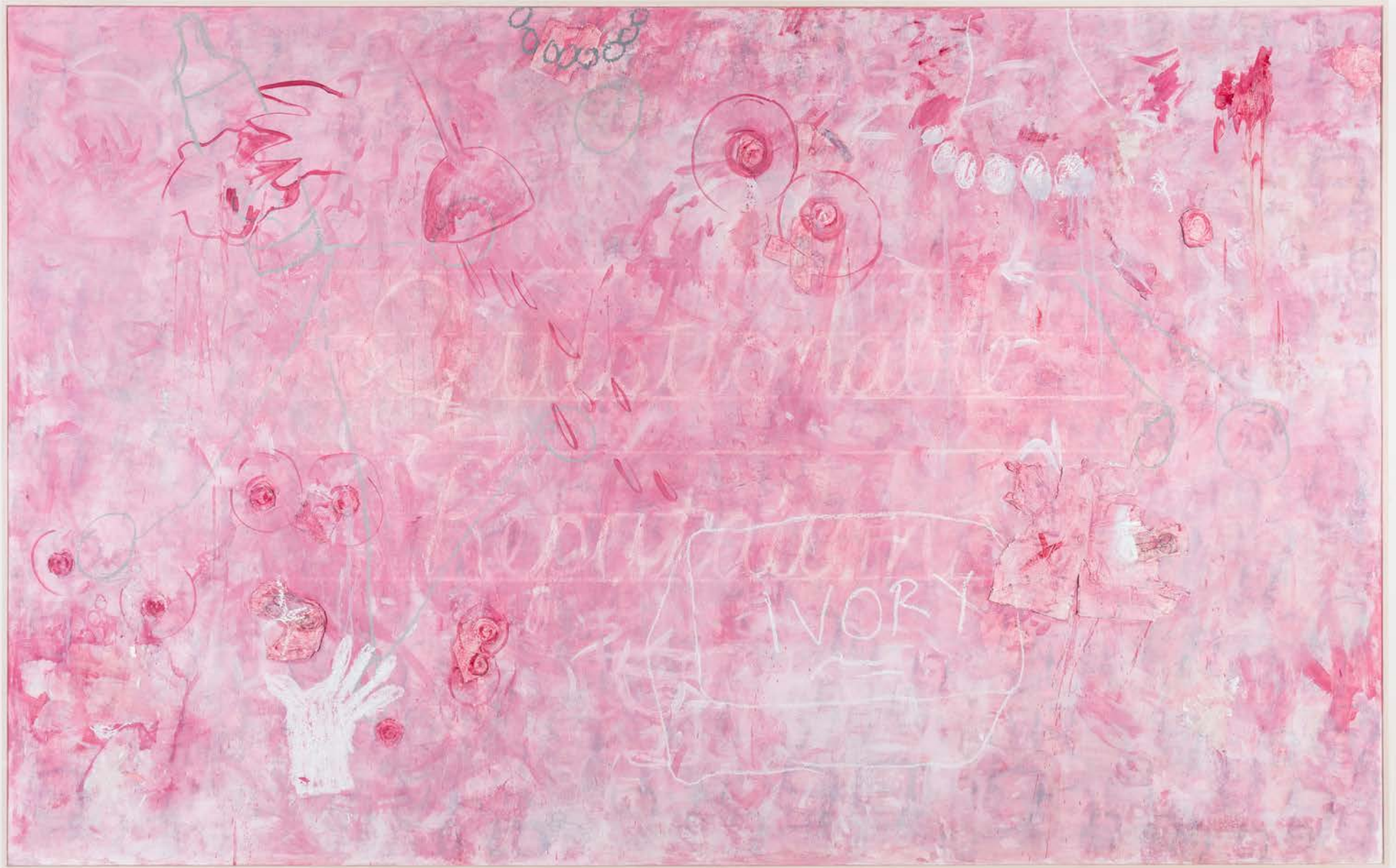
Pink Panty Dropper Mixed media on canvas