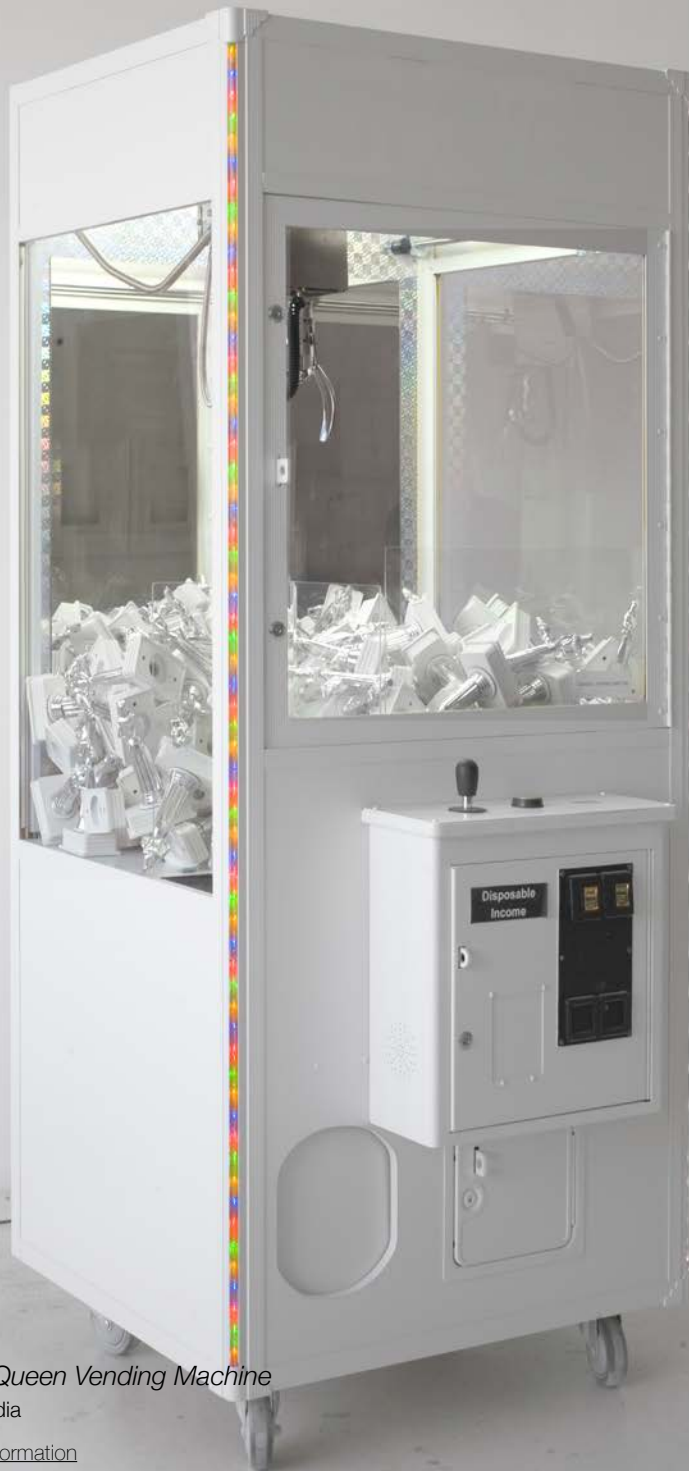
Beauty Queen Vending Machine