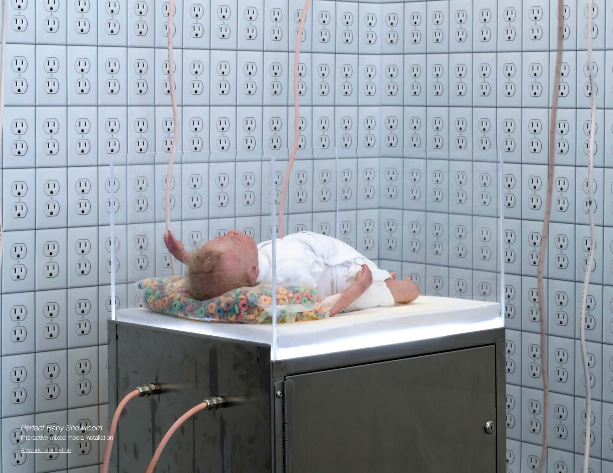
Perfect Baby Showroom Interactive mixed media installation