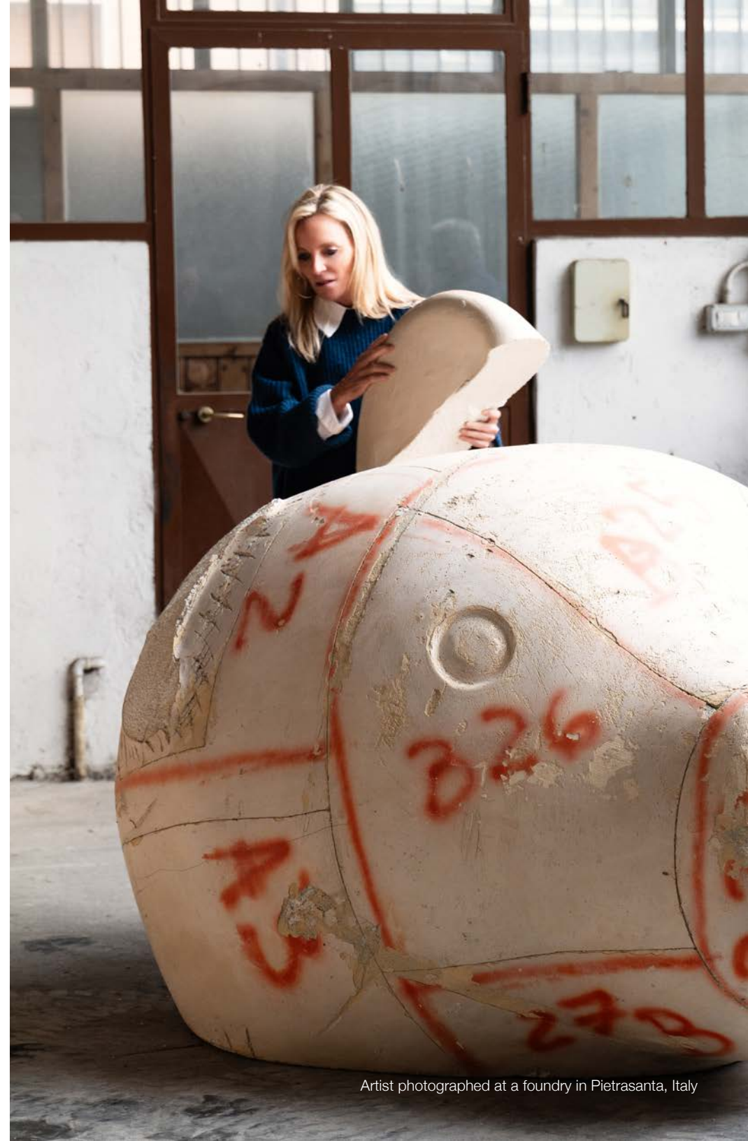
Artist photographed at a foundry in Pietrasanta, Italy